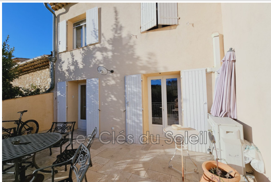
House 13162 La Celle

EXCLUSIVE - LA CELLE - 83170 - DISCOVER THIS VERY PRETTY VILLAGE HOUSE WITH TERRACE AND GARDEN TYPE 3 A REAL COCOON. 69 m 2 of living space and 101 m 2 of floor space. This house offers on the ground floor a pleasant living room with fitted kitchen, all opening through two French windows onto a pleasant 17m 2 terrace facing south offering a clear view of the village. There is also a toilet. Upstairs you will appreciate its 2 pleasant bedrooms with sloping ceilings, its pleasant bathroom with old-world charm, its shower room with toilet. On the ground floor you will discover a laundry room, the old vaulted barn painted in white lime, its small cellar. All opening onto a covered terrace of approximately 15m 2 and its wooded garden. GUARANTEED LOVE AT FIRST SIGHT No work required for this beautiful village house with cottage decor. Located close to the village center and amenities - parking nearby. THE KEYS TO THE SUN BRIGNOLES 04 94 37 11 03