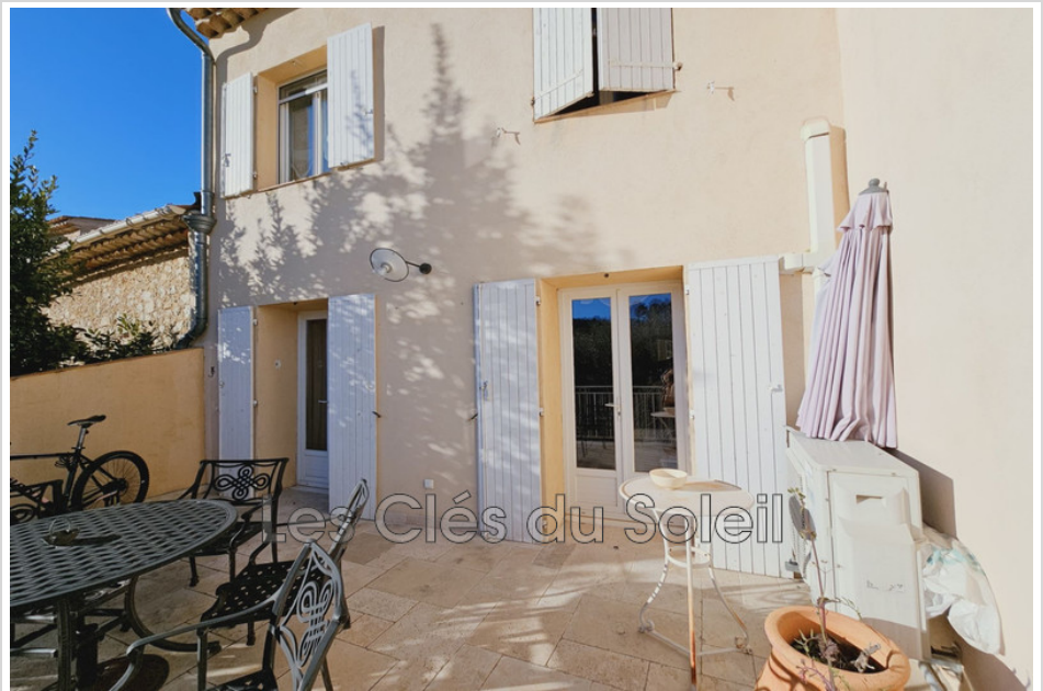
House 13162 La Celle

EXCLUSIVE - LA CELLE - 83170 - DISCOVER THIS VERY PRETTY VILLAGE HOUSE WITH TERRACE AND GARDEN TYPE 3 A REAL COCOON. 69 m 2 of living space and 101 m 2 of floor space. This house offers on the ground floor a pleasant living room with fitted kitchen, all opening through two French windows onto a pleasant 17m 2 terrace facing south offering a clear view of the village. There is also a toilet. Upstairs you will appreciate its 2 pleasant bedrooms with sloping ceilings, its pleasant bathroom with old-world charm, its shower room with toilet. On the ground floor you will discover a laundry room, the old vaulted barn painted in white lime, its small cellar. All opening onto a covered terrace of approximately 15m 2 and its wooded garden. GUARANTEED LOVE AT FIRST SIGHT No work required for this beautiful village house with cottage decor. Located close to the village center and amenities - parking nearby. THE KEYS TO THE SUN BRIGNOLES 04 94 37 11 03