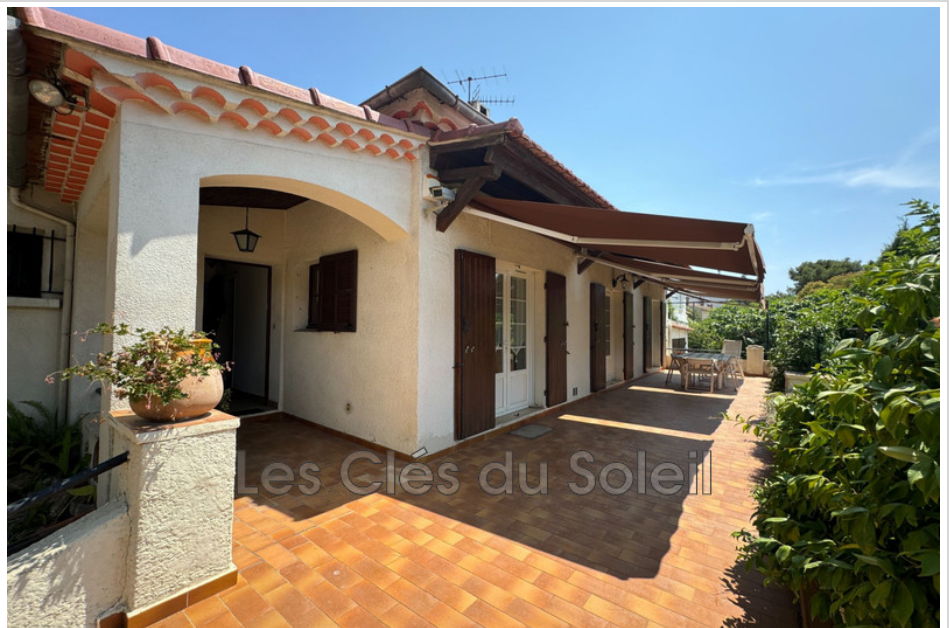
House 13001 Toulon

Toulon, Serinette, quiet, at the end of a dead end, on land of approximately 1000m 2 Single-storey house, with 3 bedrooms, including a master bedroom with dressing room, bathroom, shower room and 2 toilets, an independent kitchen opening onto the terrace and the living room, the dining room with fireplace too. This South West facing house benefits from 3 electric blinds, recent PVC joinery, a garage, 2 terraces, swimming pool land, with an up-to-date update: this property is a gem! LES CLES DU SOLEIL 0494462727